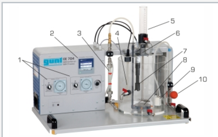
1 control elements for the compressor and for the stirring machine, 2 process controller, 3 flow meter (air), 4 pH value sensor, 5 metering device, 6 stirring machine, 7 oxygen sensor, 8 aeration device, 9 float for clear water extraction, 10 suction bulb for clear water