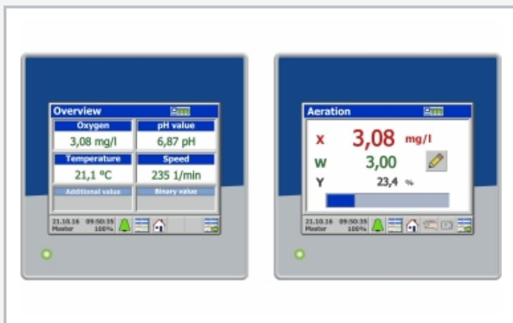
Digital process controller display of process variables (left), user interface for controlling oxygen concentration (right)