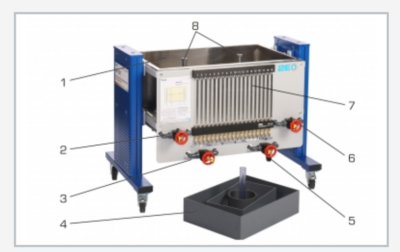
1 tank, 2 water supply, 3 water drain, 4 models, 5 water drain, 6 water supply, 7 tube manometers, 8 water drain via open-seam tube (well)