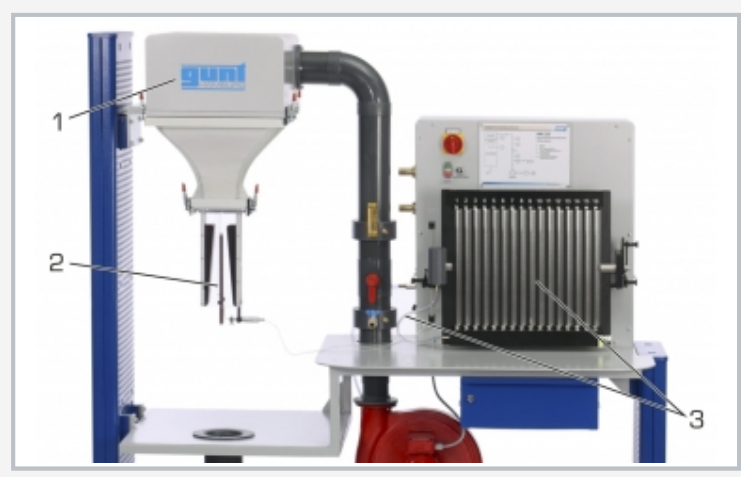
Experimental setup: 1 HM 225, 2 HM 225.02, 3 tube manometers (HM 225) with connection to HM 225.02