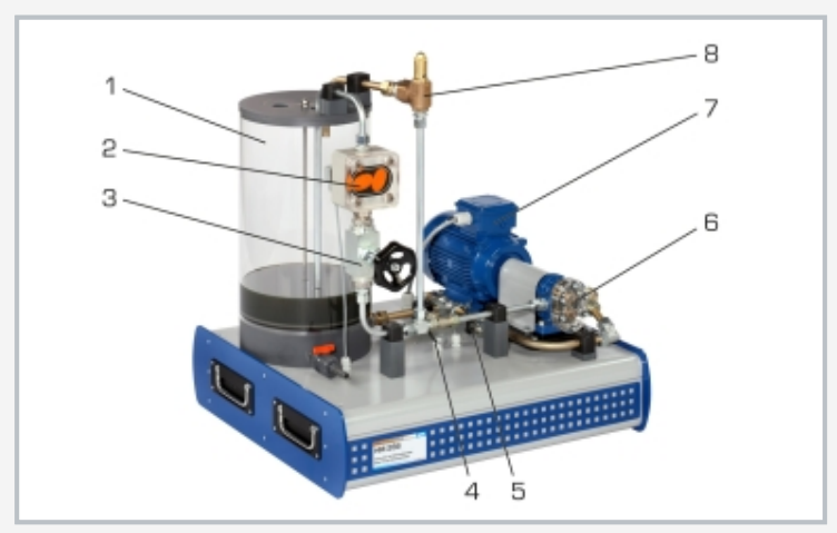
1 tank, 2 flow meter (oval wheel meter), 3 needle valve, 4 pressure sensor at outlet, 5 pressure sensor at inlet, 6 gear pump, 7 drive, 8 overflow valve for adjusting the head