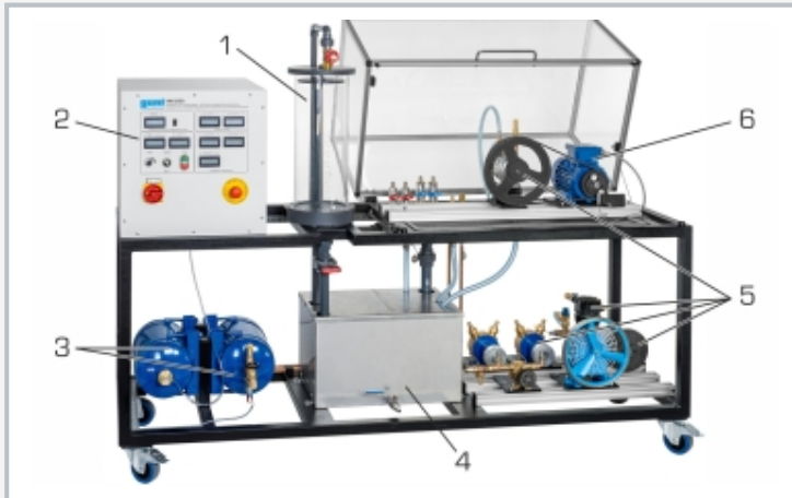
1 measuring tank, 2 displays and controls, 3 stabilisation and pressure vessel, 4 supply tank, 5 pumps and compressor, 6 drive motor