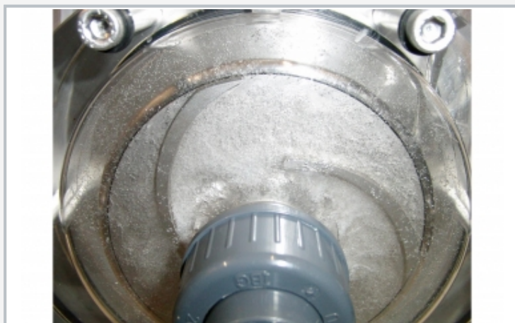
Formation of vapour bubbles due to cavitation at the pump impeller