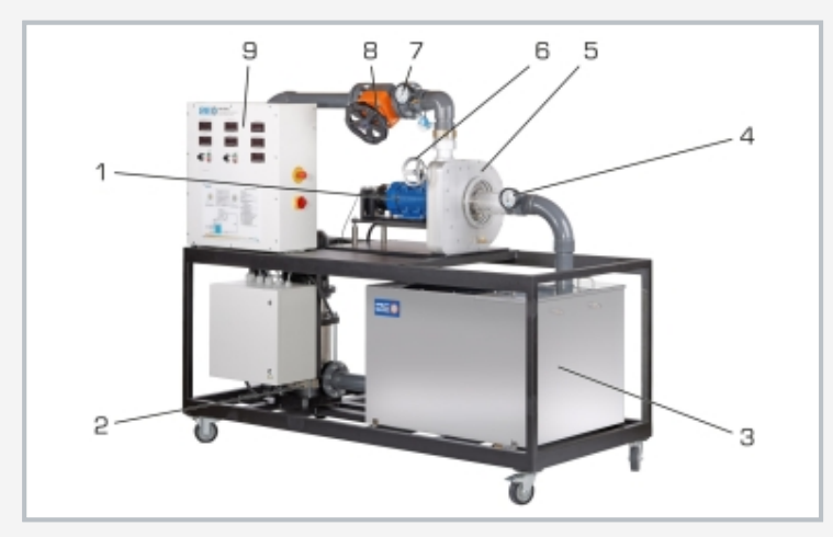
1 asynchronous machine, 2 pump, 3 tank, 4 pressure display at turbine outlet, 5 turbine, 6 adjustment of guide vanes, 7 pressure display at turbine inlet, 8 flow control valve, 9 switch cabinet with displays and controls