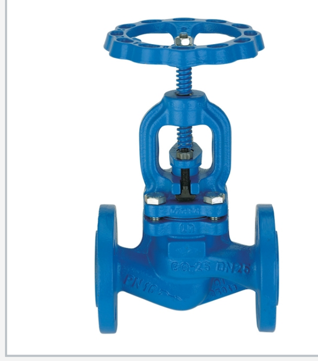
The illustration shows the shut-off valve fully assembled.