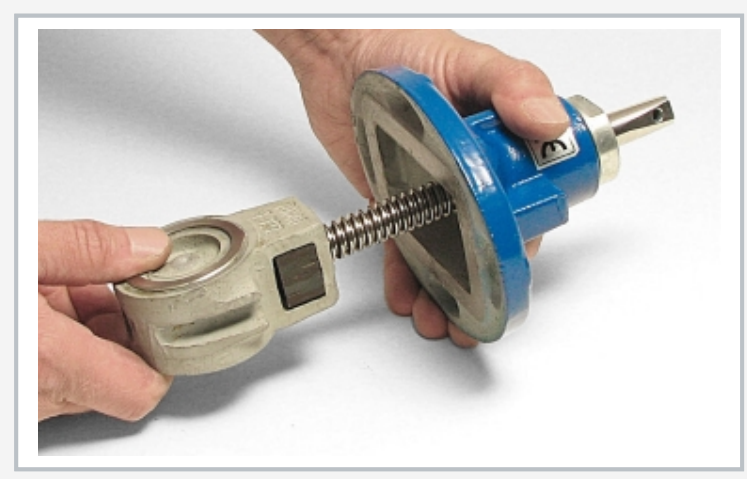
Assembly of the slider