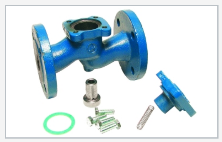
Non-return valve, disassembled