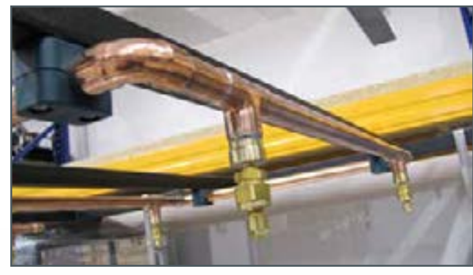
Precipitation device with nozzles for realistic simulation of rainfall

This device can be used to study seepage and groundwater flows after precipitation. In particular, the permeability and storage capacity of soils can easily be observed. Many adjustable parameters allow a wide range of experiments.