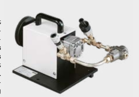
HM 365.24 Internal gear pump

Internal gear pumps are also known as crescent pumps. They are characterised by their low pulsation, high efficiency, low level of noise and medium-high operating pressures. An internal gear drives an external toothed ring. Since the driving gear is mounted on an eccentric bearing, clearances result in the gaps between the gear and the toothed ring. These clearances form the delivery volume. A crescent-shaped seal between the gear and the ring forms the enclosed volume that is necessary to reach the required pressure.