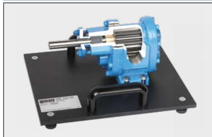
HM 700.22 Cutaway model: gear pump

To complete the oil pump training, GUNT offers sectional models and assembly and maintenance training for different positive displacement pumps: Please refer to catalogue 4 for more information on these devices.