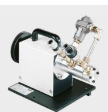
HM 365.21 Screw pump

Screw pumps are able to provide continuous delivery of even viscous media without pulsation or turbulence. Their pump housing contains two or more rotors that rotate in opposite directions, with an external screw thread profile. As the threads of the screws engage, the fluid is transported. Depending on the thread pitch, very high pressures can be achieved. Screw pumps run very smoothly, which is why they are often used in lifts and as fuel pumps in oil burners.