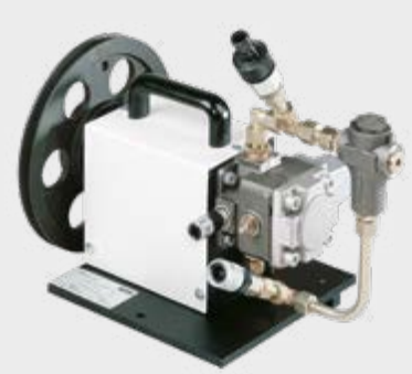
HM 365.23 Vane pump

Vane pumps are also known as rotary vane pumps. They can be used for both liquid and gaseous media. In some vane pumps, the displacement volume is adjustable. These pumps consist of a housing, in which an eccentrically installed cylinder rotates (rotor). Rotary vanes are spring-mounted to radial guides inside the rotor. During operation, the spring-force ensures that the rotary vanes run along the inner wall of the housing and an enclosed space is formed between them. The pumping medium is transported between the rotary vanes and the housing wall.